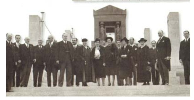
The Presidency of the Inter-Parliamentary Union at Avala, October 1938 (BMS)