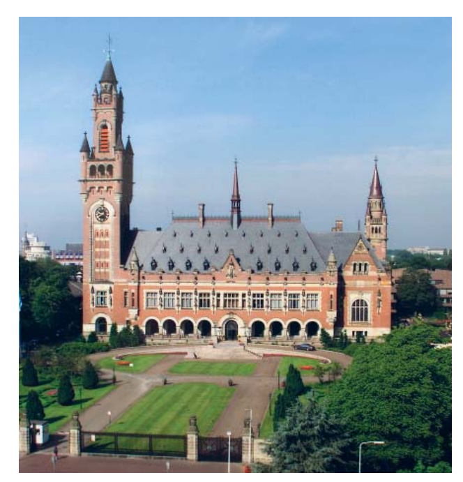
The International Court of Justice in the Hague

"In any State the authority of the government can only derive from the will of the people as expressed in genuine, free and fair elections held at regular intervals on the basis of universal, equal and secret suffrage."