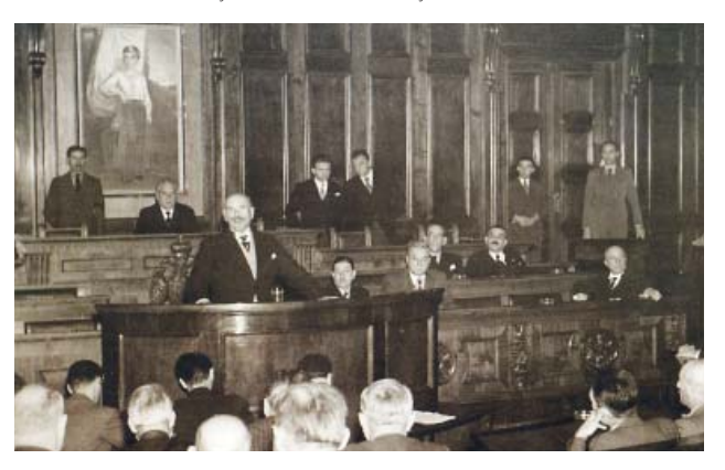
Count Carton De Wiart, President of the Inter-Parliamentary Union, speaking at the National Assembly in Belgrade, 1 October 1938 (BMS)