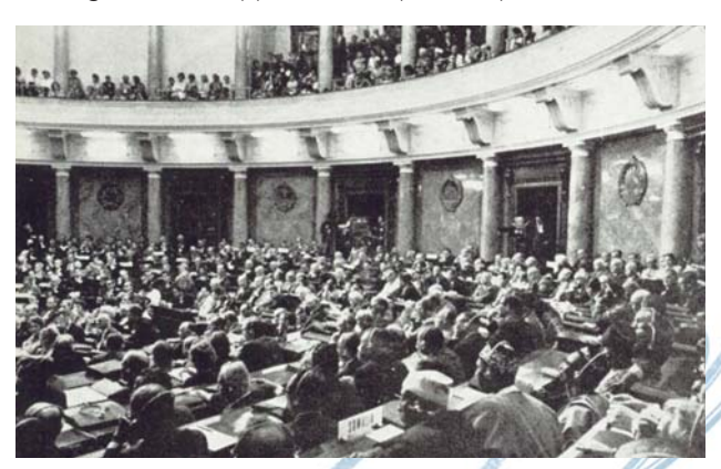
52nd Conference of IPU in Belgrade

Through such an approach and political position, the