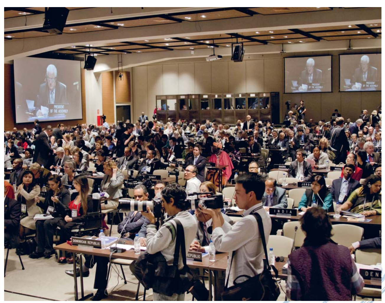
128the session of IPU, Ecquador, 2013

Union and its working bodies. The Secretary General of the National Assembly participates in the work of IPU Association of Secretaries General of Parliaments. The National Assembly participates in the work of the IPU through its standing delegation registered with the Union.