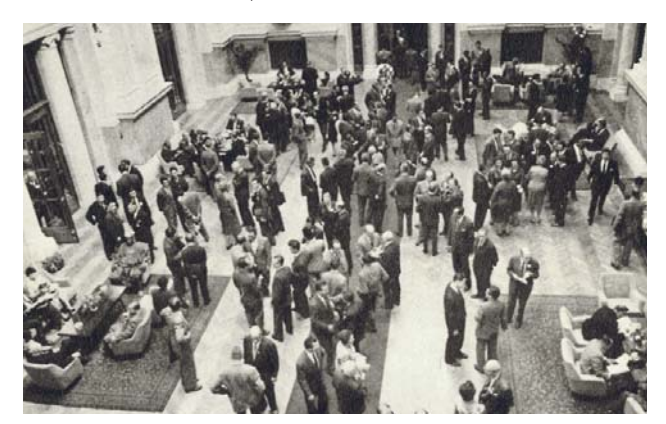
52nd Conference of IPU in Belgrade, the Central Hall

after which he proposed to the Conference to send an appeal to the Governments of the USA and USSR, which was actually done and which showed effects already during the Conference as Khrushchev and Kennedy in direct communication prevented the escalation of the crisis.